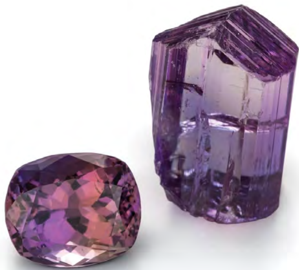
Tanzanite crystal and polished gem.

See "Class Schedules and Classroom Hours" on page 13