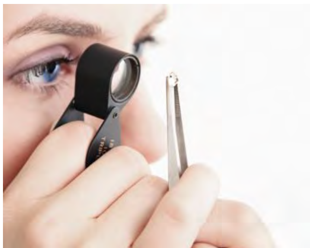
Diamond Grading Lab students assess a diamond's clarity using a 10X jeweler's loupe