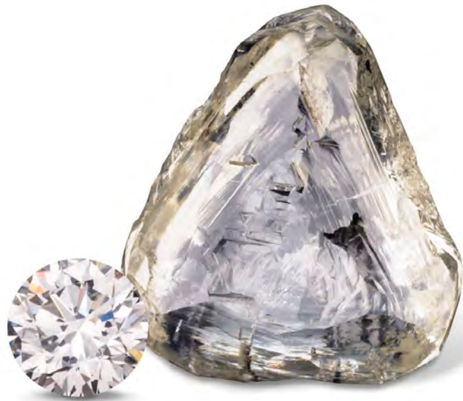
Rough and polished diamonds

See "Class Schedules and Classroom Hours" on page 13