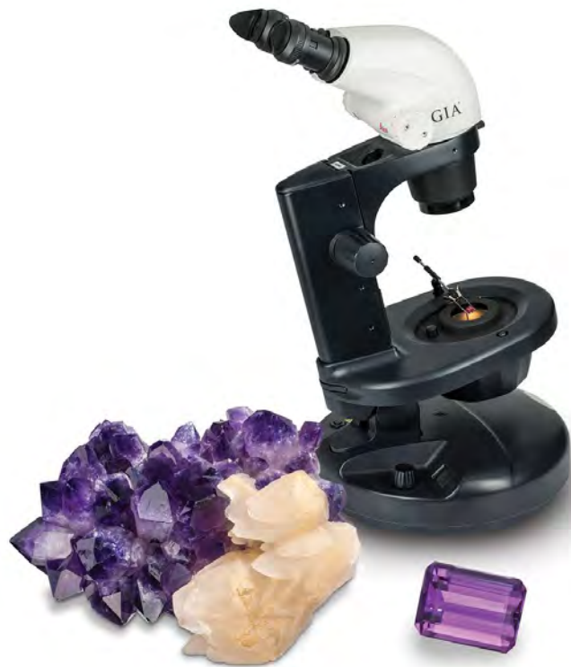
GIA microscope; rough and polished amethyst

See "Class Schedules and Classroom Hours" on page 13