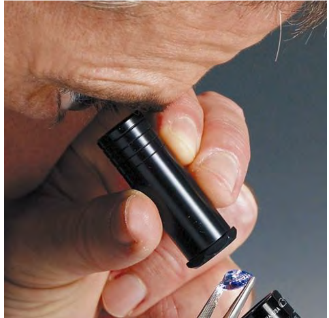
Gem Identification Lab students learn the proper use of gemological equipment like a polariscope (top) and dichroscope (bottom) - ©GIA