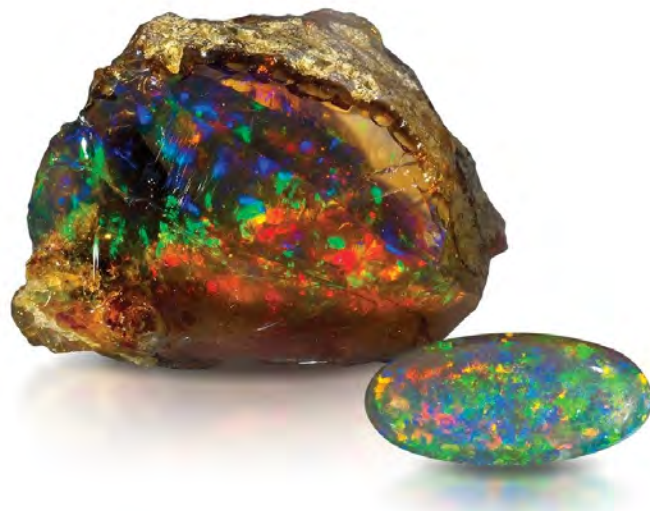
Rough and polished opal.

See "Class Schedules and Classroom Hours" on page 13