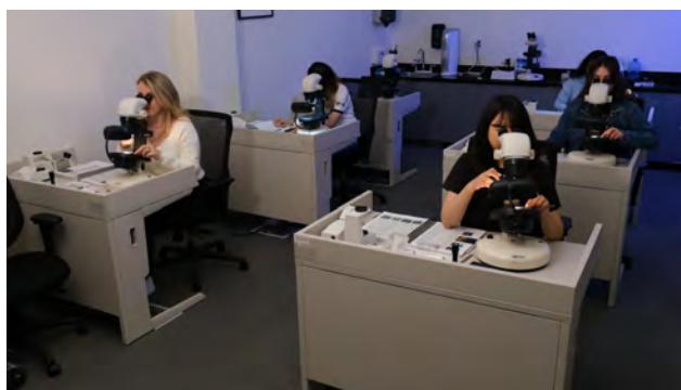
Top: GIA's Carlsbad Campus and World Headquarters; Middle: Student Lounge Area; Bottom: GIA Student Workroom