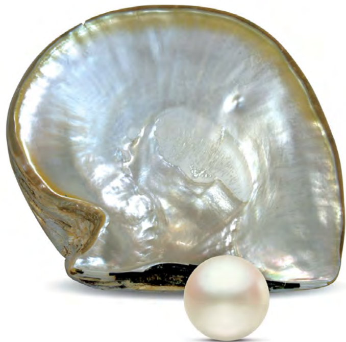
South Sea cultured pearl and mollusk - ©GIA

See "Class Schedules and Classroom Hours" on page 13